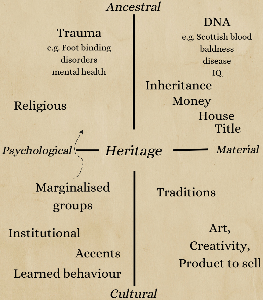
Mind map made by Charlie Dupré during school workshops. To open conversations about shared and personal heritage, he created this mind map to illustrate different types of heritage. He categorised Cultural, Material, Ancestral, and Psychological.